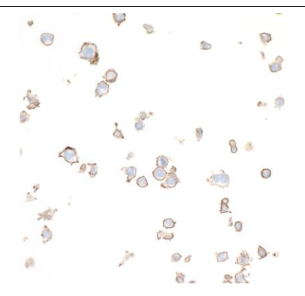
Detection of human CD86 by immunocytochemistry. Sample: FFPE section of HDLM-2 cells. Antibody: Rabbit anti-CD86 recombinant monoclonal antibody [BLR029F] (A700-029 lot 1) used at 1:200. Secondary: HRP-conjugated goat anti-rabbit IgG (A120-501P). Substrate: DAB.